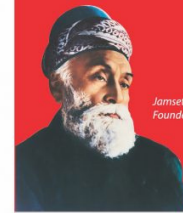
Jamsetji Tata Founder, Tata group