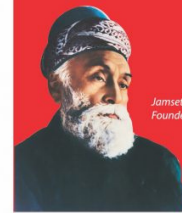
Jamsetji Tata Founder, Tata group