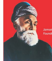
Jamsetji Tata Founder, Tata group